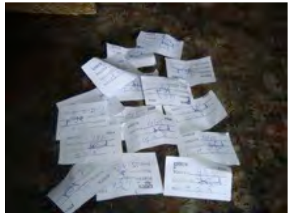
IDPs Receiving Tokens