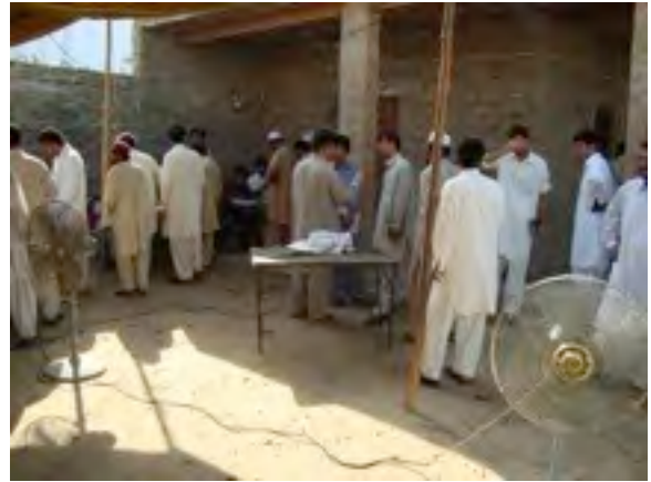
Chairman Mahsud Committee, Field Coordinators and SRSP Team