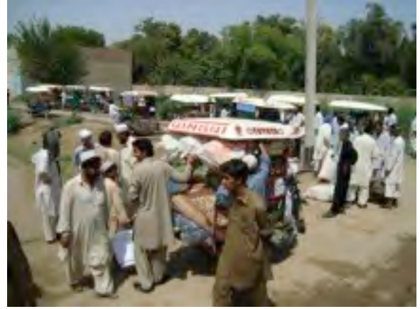
Assistance with Carrying NFIs to Local Transport