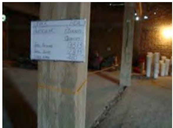
VIP Colony Warehouse