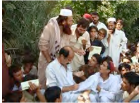
IDPs Outside the Distribution Center