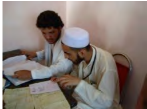
Verification Against NADRA List