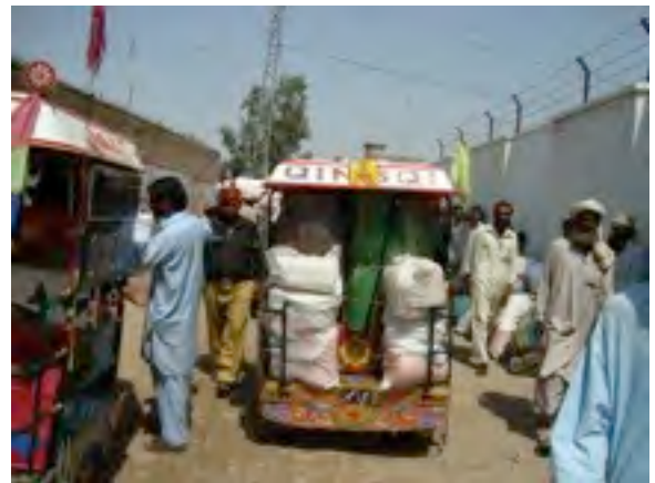
Laborers Assisting with Carrying NFIs