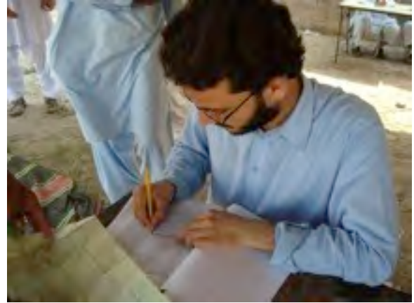
Verification Against NADRA List