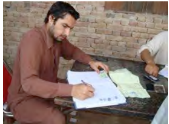
Distribution Officers Entering Particulars in the Distribution Register