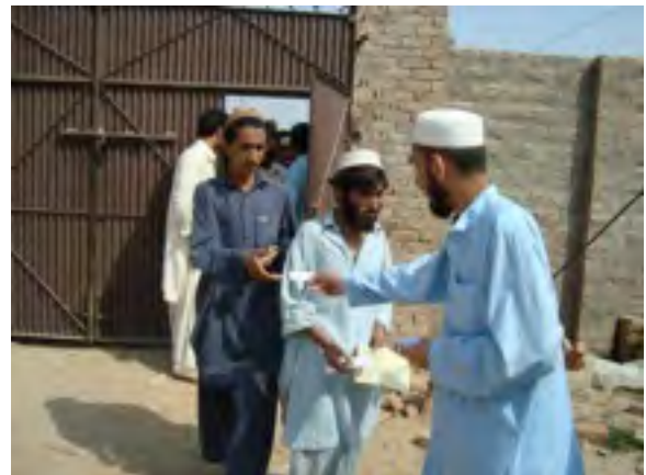
IDPs Receiving Tokens