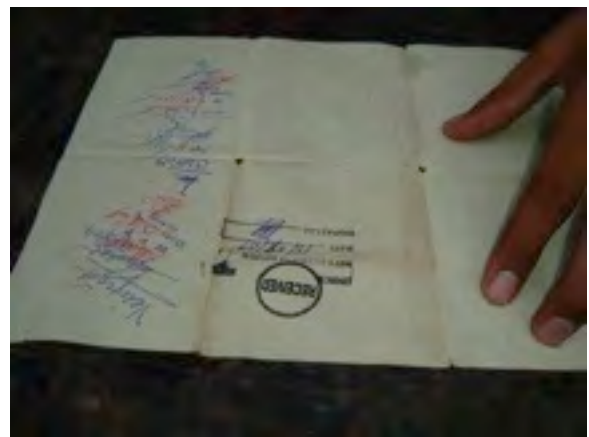
Sample of Stamp