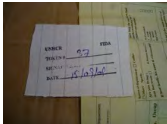
IDPs Receiving Tokens