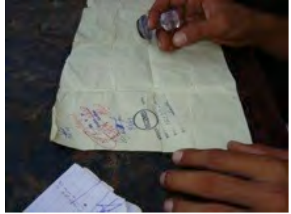
Fixing Stamp to Indicate the NFI Has Been Received