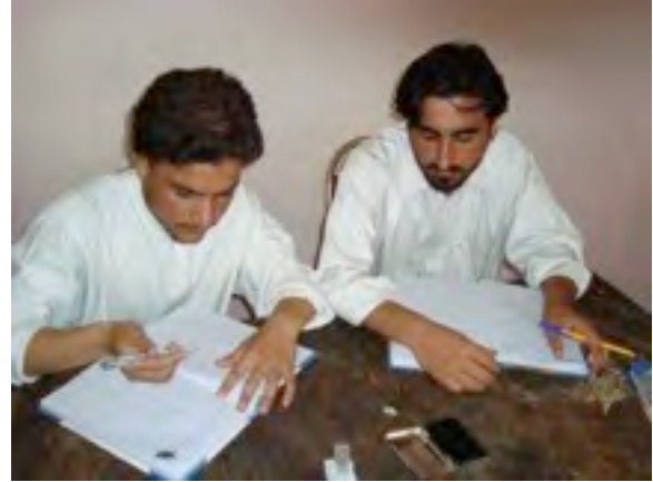
Distribution Officers Entering Particulars in the Distribution Register