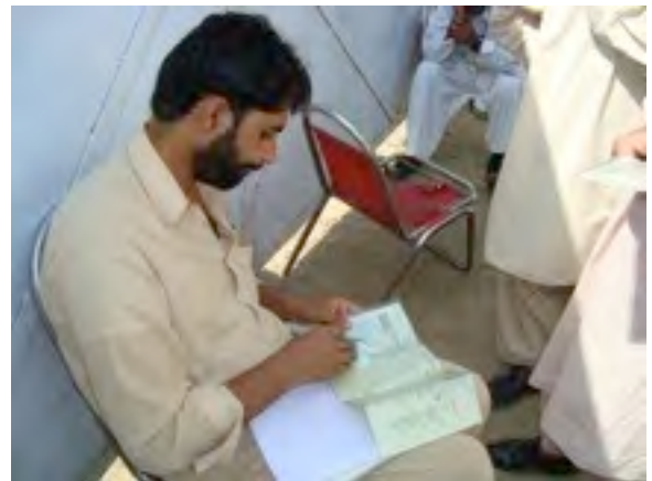
Verification Against NADRA List