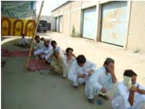
Line for Distribution