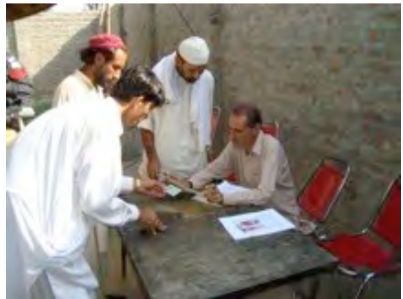
Protection and Help Desk Officers