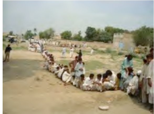
IDPs Outside the Distribution Center