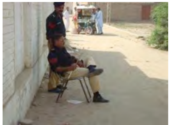
Security at Daraban Distribution Point