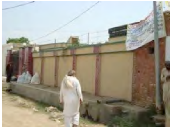
Outside VIP Colony Distribution Center