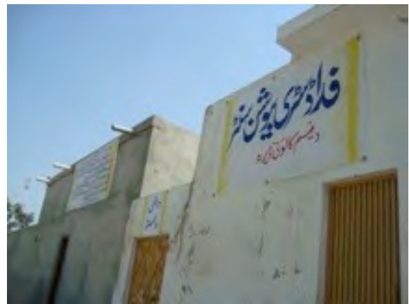
Signage Outside Site