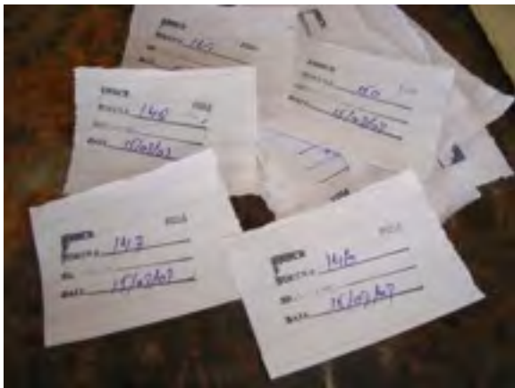
Sample of Tokens