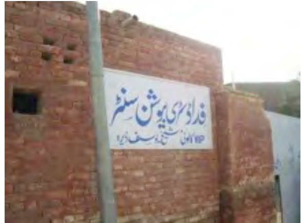
Signage Outside Site Warehouse