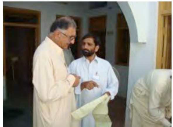
Addressing Security Concerns