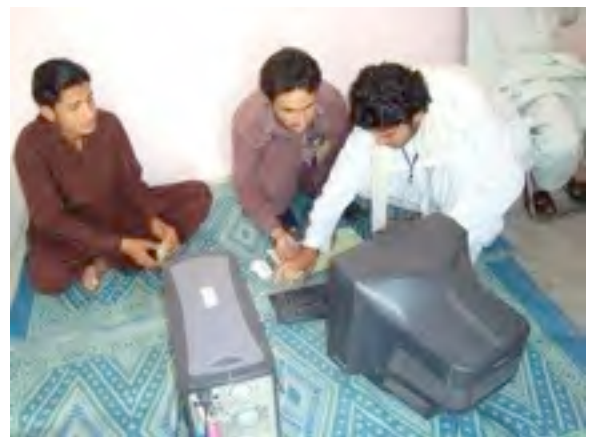
Compiling Daily Reports