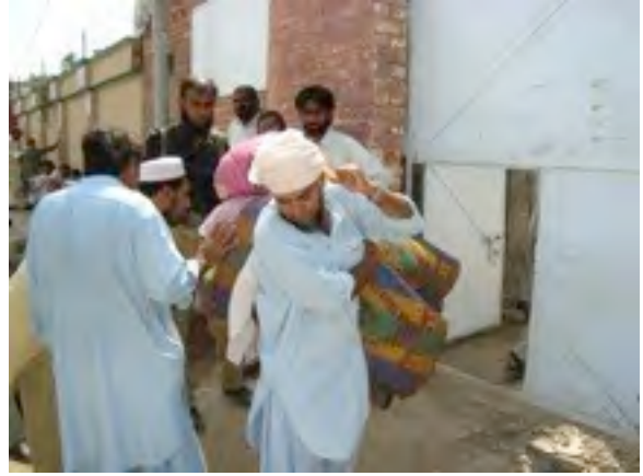
Laborers Assisting with Carrying NFIs