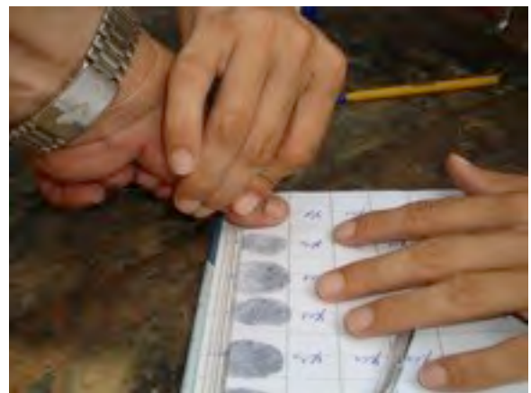
Taking Thumb Impressions on Distribution Register as Evidence for Receiving NFI Kit