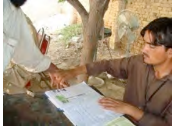
Taking Thumb Impressions on Distribution Register as Evidence for Receiving NFI Kit