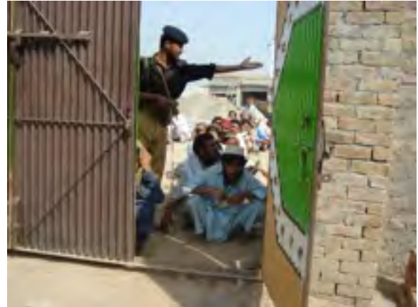
IDPs Standing Outside the Distribution Center