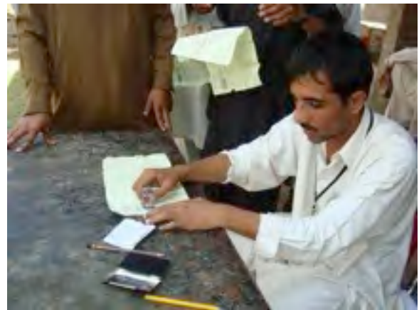
Fixing Stamp to Indicate the NFI Has Been Received