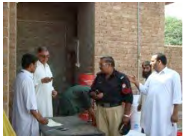
Tribal Committee Members and FIDA Staff Monitoring the Process